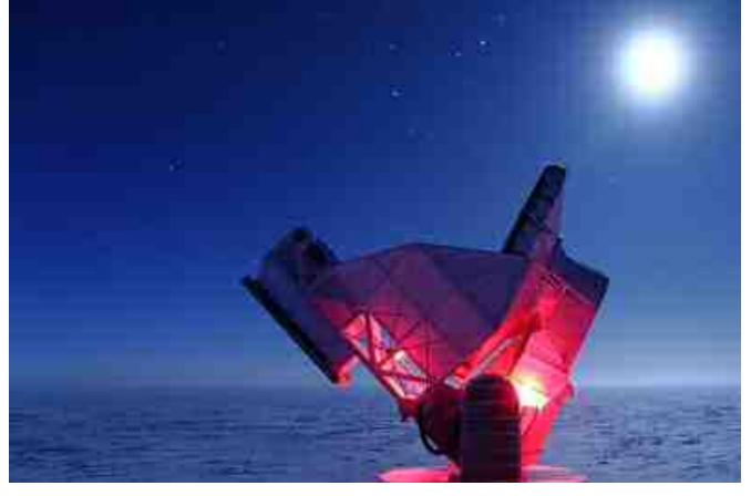
Phys.org Oct 29, 2013 by Louise Lerner